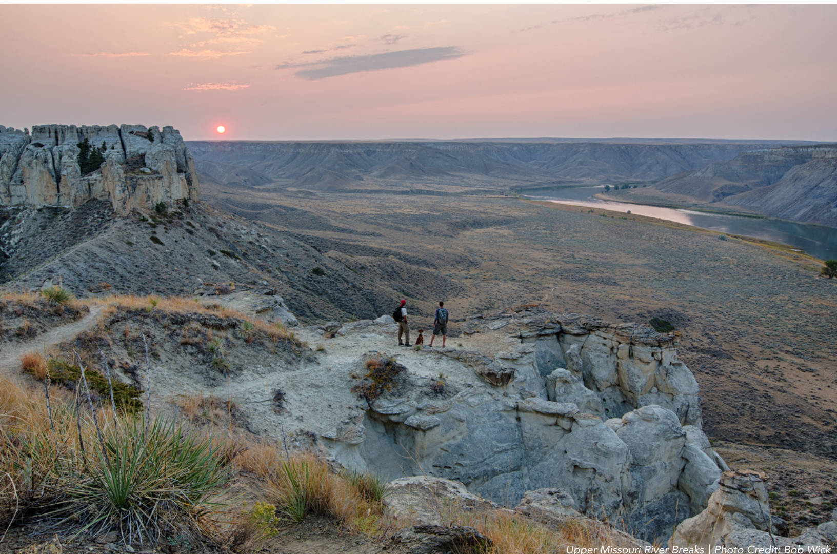
Upper Missouri River Breaks

Montana has one of the fastest growing economies in the country , much of which can be attributed to its robust outdoor recreation sector. In recent years, this is leading to a large influx of college educated residents who are able to further diversify the state's economy. Importantly, business owners whose livelihoods rely on healthy, protected ecosystems support more legislation and action to ensure that Montana retains its beautiful, natural landscapes into perpetuity.