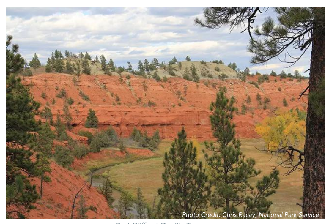
Red Cliffs at Devil's Tower

In raw numbers, the amount of money that outdoor recreation generated towards Wyoming's <u>GDP in 2021 was $1.5 billion</u>. Combining this with the contribution that outdoor recreation made to the economy in 2020 brings