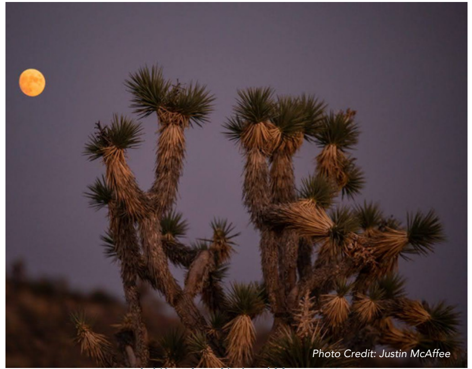
Avi Kwa Ame National Monument

Located south of Las Vegas, Avi Kwa Ame, roughly translates to "Spirit Mountain" in Mojave. The mountain, which is on the eastern boundary of the newly established 506,814 acre <u>national monument</u>, is sacred to twelve Native American tribes. The new monument was <u>designated</u> by President Biden on March 21, 2023. Through the hard work of these tribes, local residents in the towns of Searchlight, Boulder City, and Laughlin, the Nevada Legislature, and a coalition of conservation and recreation groups, this sweeping landscape has now become Nevada's