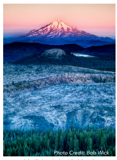
Medicine Lake Highlands

The Pit River Nation and their allies have asked others to unite in calling on President Biden to work with California's federal delegation to protect their homelands from the relentless threats from industrial energy development by designating a little more than 200,000 acres of US Forest Service managed public land in an area known as Sáttítla in the Medicine Lake Highlands as a national monument.