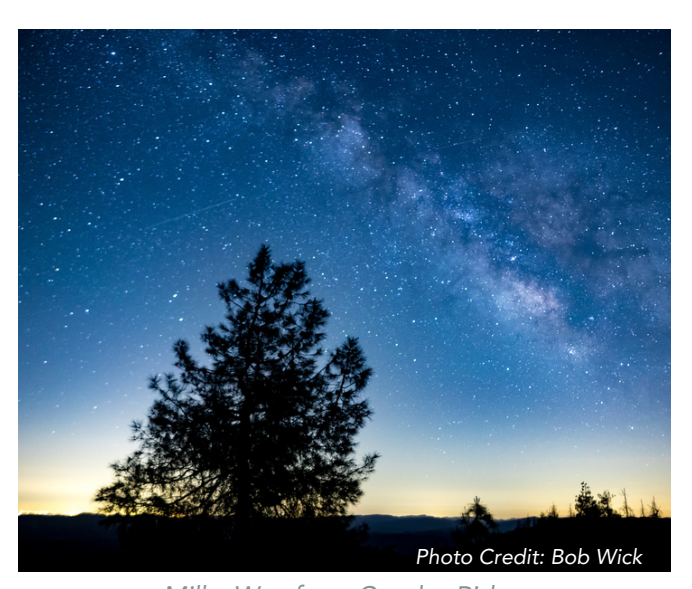
Milky Way from Condor Ridge

The expansion of Berryessa Snow Mountain National Monument would safeguard public lands that are sacred to the Yocha Dehe Wintun Nation.