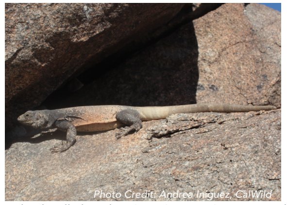
A chuckwalla lizard at Corn Springs Campground

The monument would permanently protect approximately 660,000 acres of federal public lands that reach from the Coachella Valley region in the west to the Colorado River in the east. Designating the Chuckwalla National Monument would help ensure equitable access to nature, honor a cultural landscape, and protect the desert's unique biodiversity, wildlife habitat and landscape connectivity, and history.