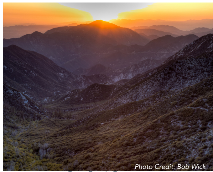
Bear Creek Canvon

Expanding the monument is the next step in a 20-year, locally-driven effort to protect the San Gabriel Mountains, an area known as the "gateway" to the Angeles National Forest. It is one of the most visited parts of the forest receiving 4.6 million visitors in 2021—more than either the Grand Canyon or Yosemite National Park.